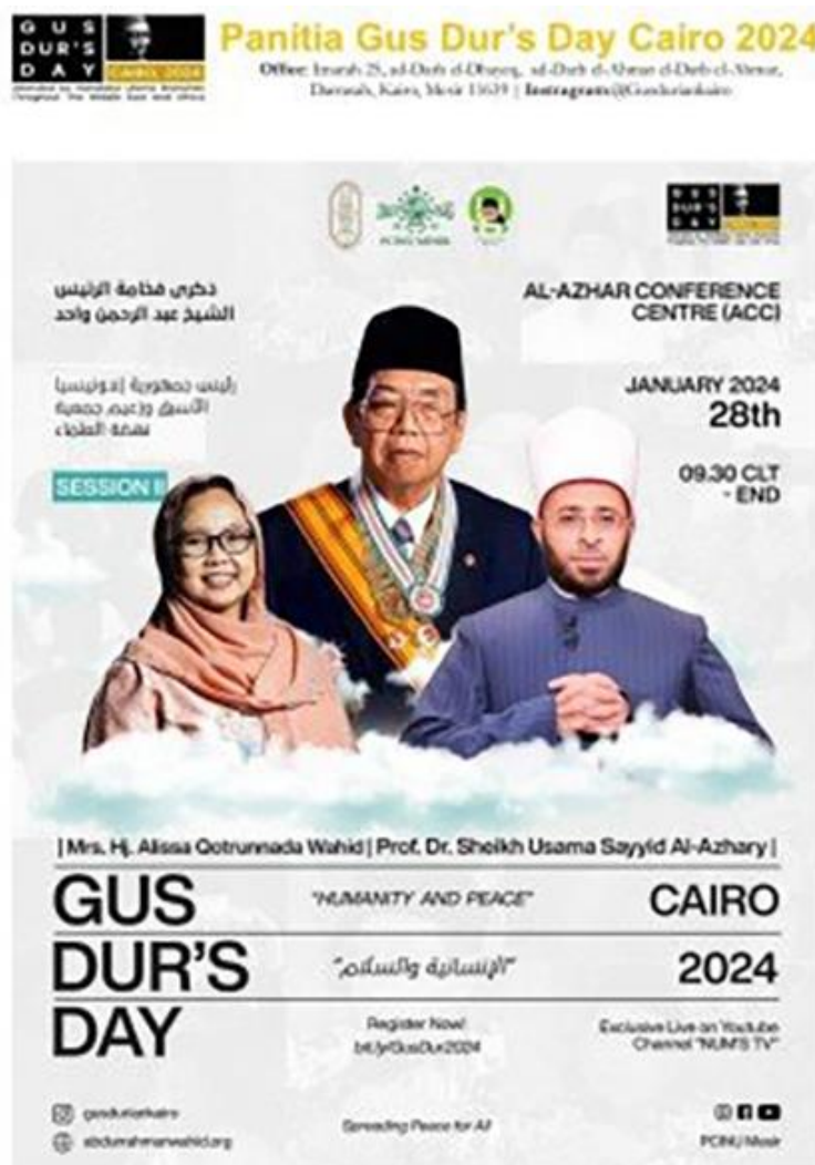
al-Azhar celebrates the life and legacy of Indonesia’s former president