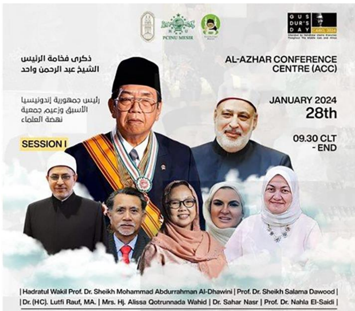
al-Azhar celebrates former Indonesian President Abdurrahman Wahid

[On Sunday, Egypt's pre-eminent center of Islamic authority] al-Azhar celebrated the memory and legacy of Indonesia's fourth president, KH. Abdurrahman Wahid, who was the nation's first head of state to be democratically elected.