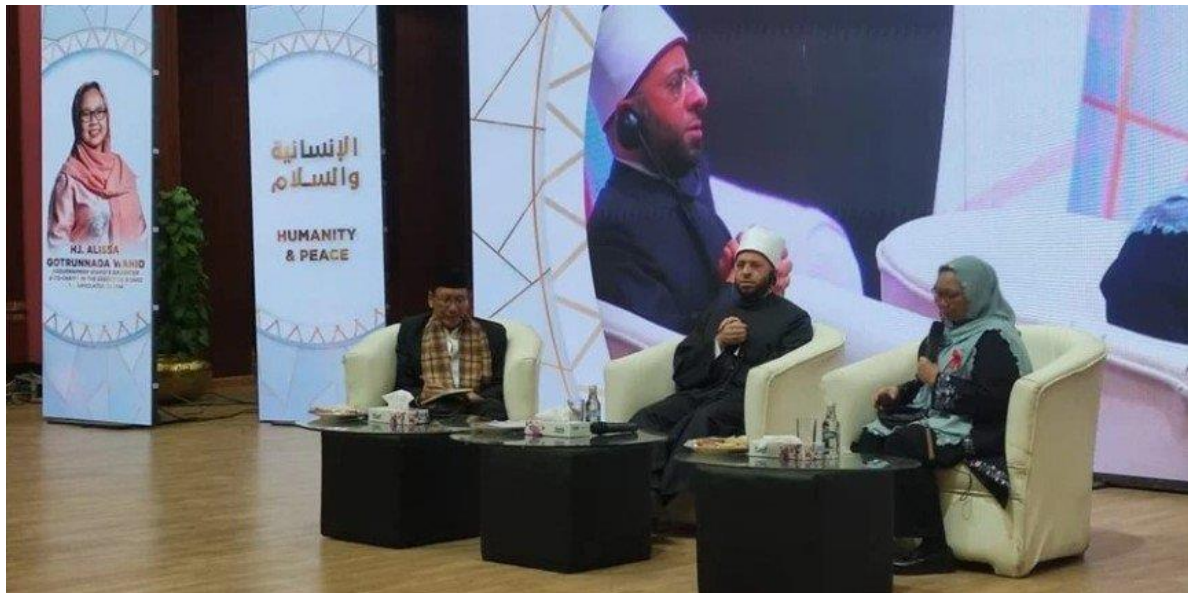
The daughter of President Abdurrahman Wahid at al-Azhar University